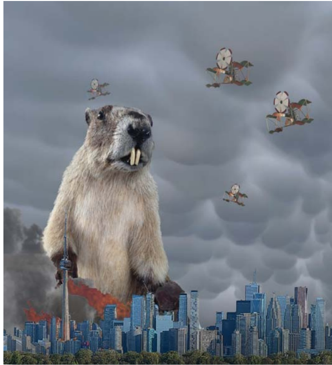
Bad Day in Toronto Ken Jones